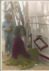
NAVAJO TRADITION MONUMENT VALLEY, UT