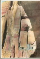
BETATAKIN NAVAJO NATIONAL MONUMENT, AZ

Hand-tinted lantern slides from the book LANDSCAPES ON GLASS _____ Greeting Cards